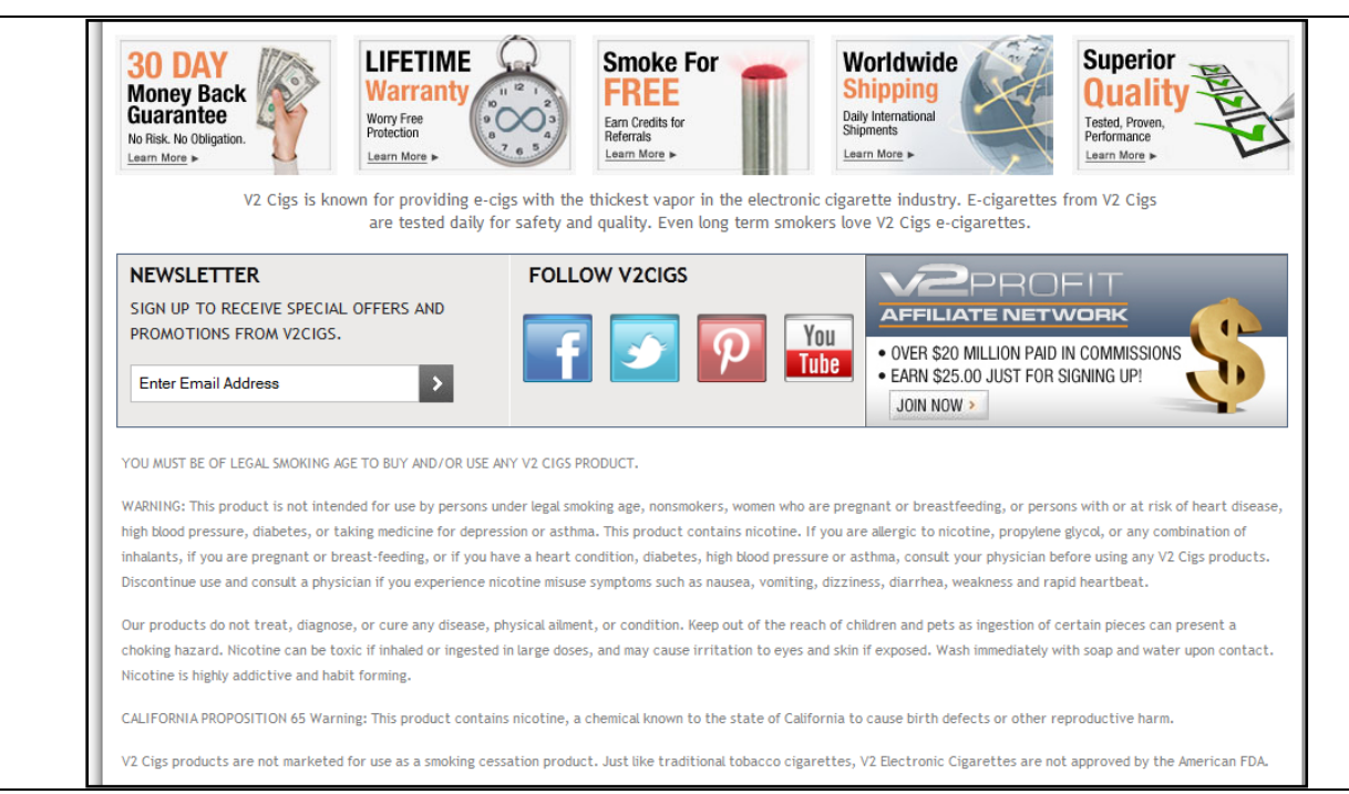
Figure 5. Disclaimer on the bottom of the www.v2cigs.com homepage. The last line read: "V2Cigs products are not marketed for use as a smoking cessation product. Just like traditional tobacco cigarettes, V2 Electronic Cigarettes are not approved by the American FDA."