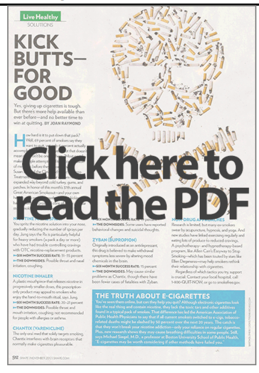
Figure 6. Full text of the blog entry on the RivoSig site with accompanying image on January 14, 2013: https://rivosig.com/blog/#.UPCFhdXCnWB. Where it says "Click here to read the PDF" is a link to https://rivosig.com/media/wysiwyg/rivosig-electronic-cigarettes-shape-magazine.pdf

Take a look...we'll let their editors do the talking for us: