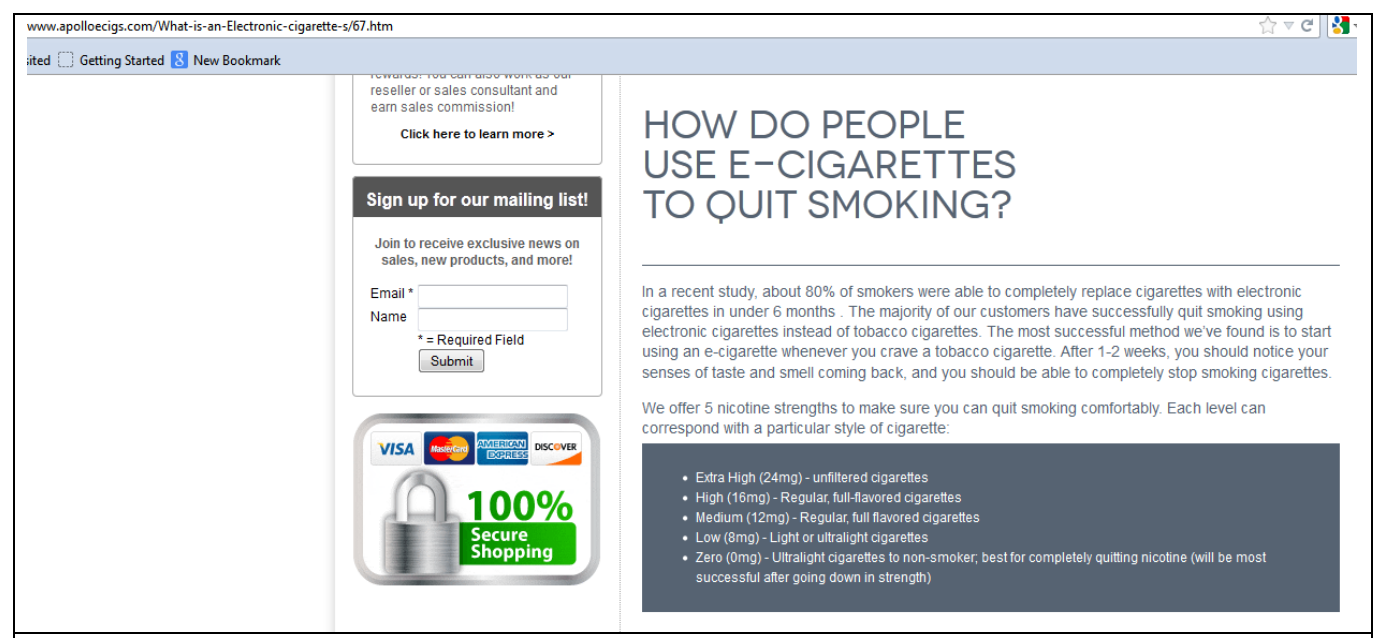
Figure 3. Presence of therapeutic claims on e-cigarette websites.

Information about using an e-cigarette to "slowly decrease your nicotine addiction without the stress of giving up the behavioural pleasures of smoking" on the homepage of www.usaecigarette.com (top) and information about how Altimoff e-cigarettes can be used to quit smoking in the FAQ section of www.usaecigarette.com (middle), January 15, 2013. Information on Apollo Ecigs website: "How do people use e-cigarettes to quit smoking" http://www.apolloecigs.com/What-is-an-Electronic-cigarette-s/67.htm (bottom), January 15, 2013