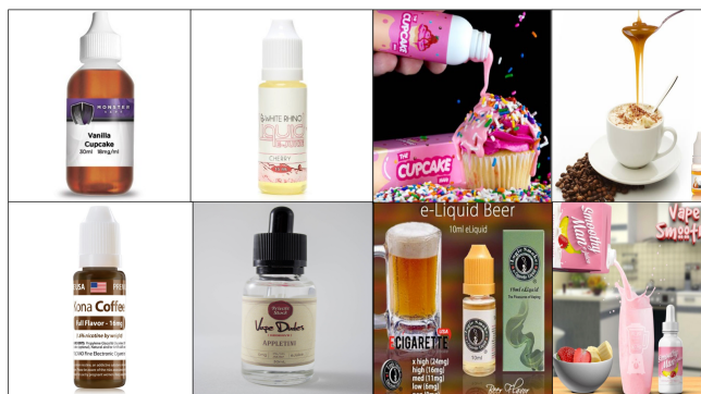
Figure 2. Flavored e-cigarette ads shown to adolescents and young adults to elicit perceptions of the age of audience being targeted for each ad.