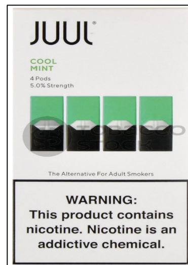
Figure 1. Warning that simply says a product is addictive or contains an addictive chemical will not be understood by youth.

Flavor or “taste” is one of the most common persuasive marketing techniques used to promote food (mostly candy and snacks) to children on TV. 21 Exposure to ads for flavored products is positively associated with youth consumption, 22 and most money spent by youth is on food or beverages, particularly sweets. 23 Research on e-cigarettes is consistent with these findings, concluding: flavors play an important role for online e-cigarette marketing and boosts user